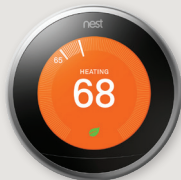
Nest Learning Thermostat