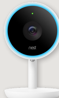
Nest Cam IQ Indoor