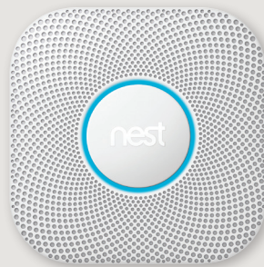
Nest Protect smoke + CO alarm