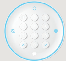
Nest Secure alarm system